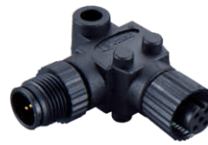
Plastic fix screw